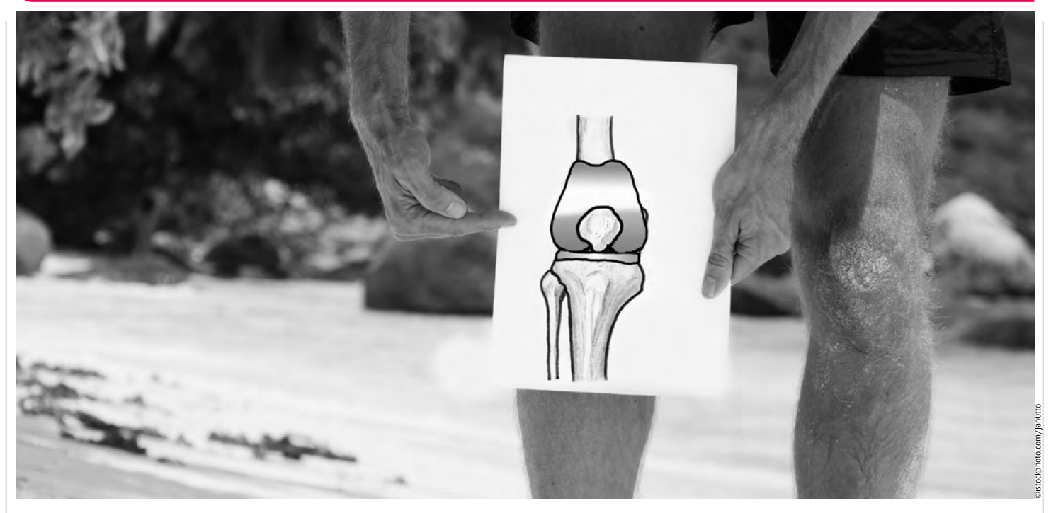
Stretch goals help patients recover from knee surgery