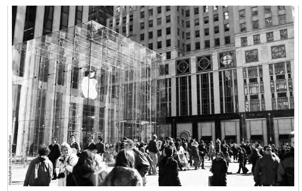
Apple, Lego and Virgin Media all use Net Promoter Score